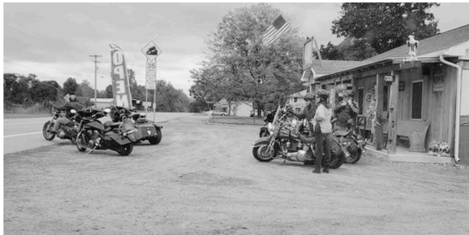
FALL FOLIAGE RIDE