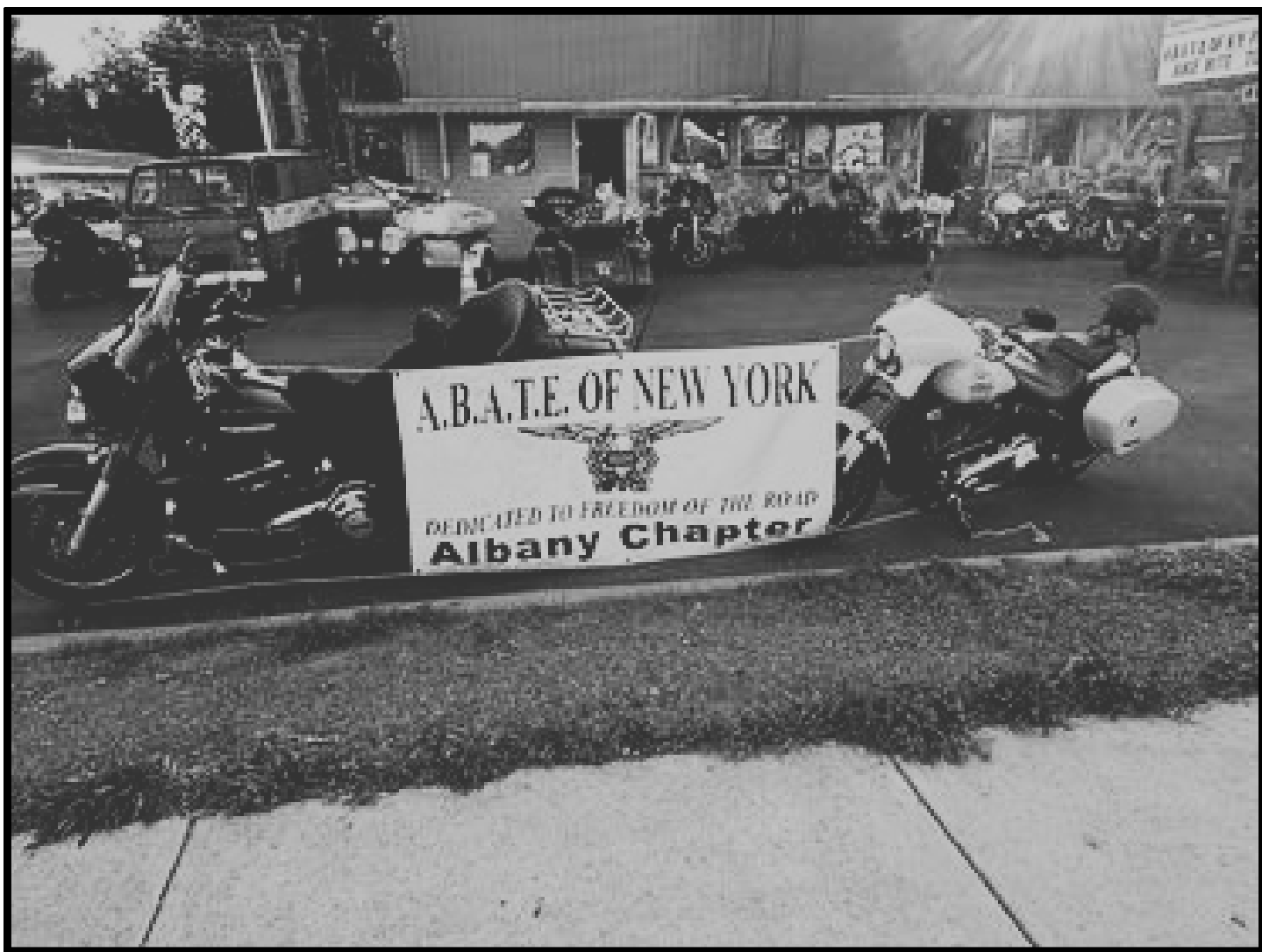
ALBANY COUNTY CHAPTER BIKE NIGHT